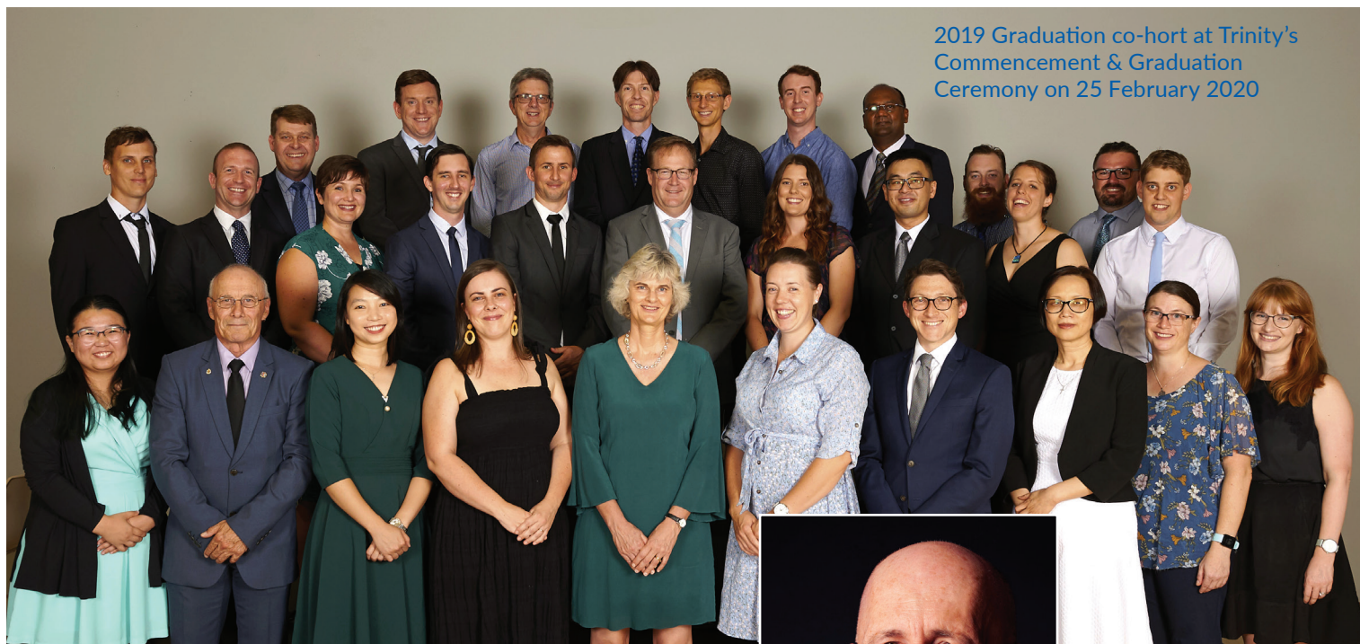
2019 Graduation co-hort at Trinity's Commencement & Graduation Ceremony on 25 February 2020

It is written: "I believed; therefore I have spoken." Since we have that same spirit of faith, we also believe and therefore speak, because we know that the one who raised the Lord Jesus from the dead will also raise us. (2 Corinthians 4:13-14)