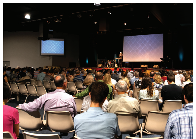
Graduation saw a great turnout of people from many churches across Perth